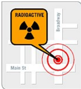
Info From Local Authorities

A radiation threat or "Dirty Bomb" is the use of common explosives to spread radioactive materials over a targeted area.