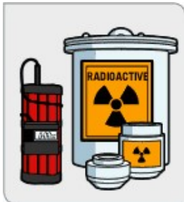
Use of Common Explosives