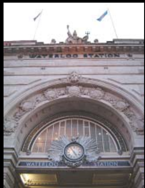
End game for some members of the Portland spy ring at Waterloo Station