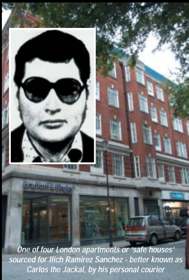
One of four London apartments or 'safe houses' sourced for Ilich Ramirez Sanchez - better known as Carlos the Jackal, by his personal courier