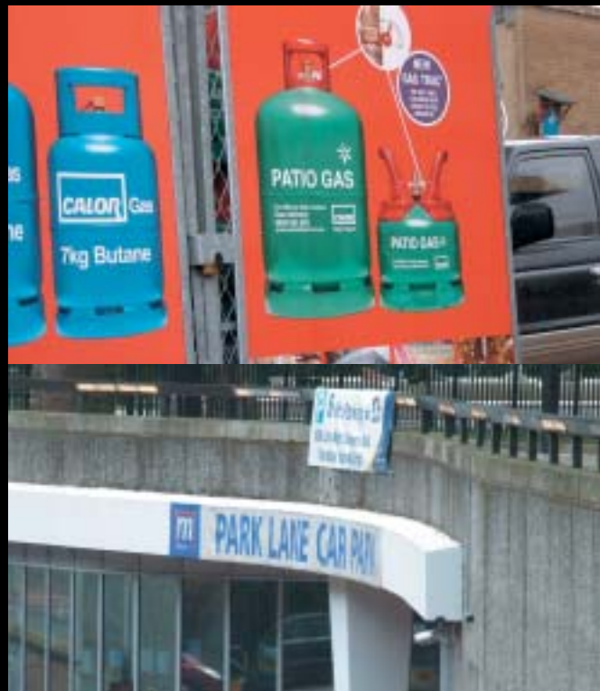
The Park Lane Garage/compound where the second Mercedes was located after being towed away in central London

'Place 12-13 full size [gas] cylinders in each Limo. A few should be sprayed yellow because yellow cylinders in the West signify toxic gas.... this will aid to spread terror and chaos when the emergency service teams arrive. Underneath and around the cylinders generously place some loose pieces of charcoal (that have been pre-soaked in petrol). Place a 10-litre petrol [?] containing nails next to each cylinder.'