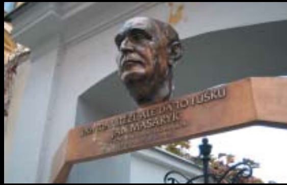
The memorial to Jan Masaryk - a Czech diplomat "removed" by the KGB