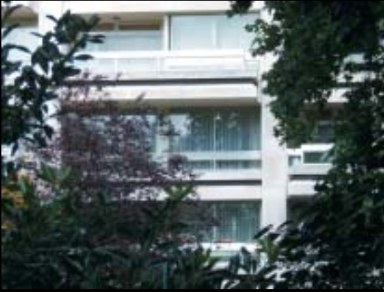
Marwan's London apartment

Like Aleksander Litvinenko, the recent death of Egyptian billionaire Ashraf Marwan has been linked to the 'underbelly' of the intelligence world. Marwan, the son-in-law of the late President Gamel Abdel Nasser, was found dead on the pavement beneath his fourth-floor flat in Carlton House Terrace, in the affluent Mayfair district of London. Police, who were called at 1.40pm by residents on 27 June, are treating his death as "suspicious" and "unexplained". According to Marwan's colleagues, he was working in his office at the time and the only other person in the flat was his maid. Colleagues and friends believe he would not have committed suicide.