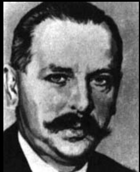
Lt. Colonel Michal Goleniewski

RAFTER was employed against Lonsdale. But not before the contents of Lonsdale's bank safety deposit box had been X-Rayed, physically examined and photographed.