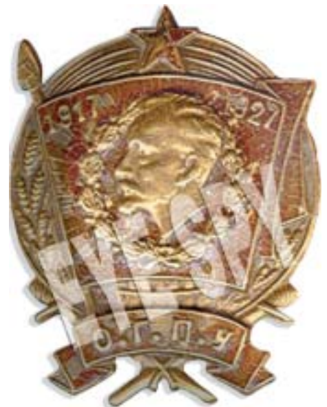
Eye Spy examines the key moments and individuals in the evolution and creation of Russia's foreign intelligence collection service - SVR