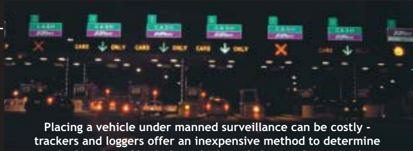
Placing a vehicle under manned surveillance can be costly - trackers and loggers offer an inexpensive method to determine the location of both the vehicle and places it has visited

One of the fastest growing areas of surveillance is electronic tracking. Previously only available to the intelligence world, ordinary people can now purchase a variety of trackers that use and interact with the Global Positioning System (GPS). Many people imagine such devices have limited use, but the security industry is vast, and so is this area of surveillance.