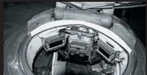
Intel photo - inside the T-64 Soviet tank

Secret photography had established that the new Soviet battle tank was a formidable fighting machine, boasting a 125mm smoothbore gun and an automatic loading system that cut crew numbers from four to three. What photography could never reveal was the depth of the T-64's armour and how effective it would be against NATO anti-tank weaponry.