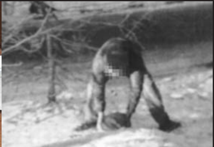
Left: The MI6 device recovered by Russia's FSB. Right: An alleged MI6 officer caught on surveillance camera with the 'spy rock'

Central to the Rossiya claims was a light brown plastic 'rock' about 15 inches long. The object was hollow and inside the watertight box, a communications system for transmitting and receiving signals. The device was powered by several long-life lithium batteries. Moscow claims it was placed in the park in September 2005 by an "MI6 officer" already under surveillance.