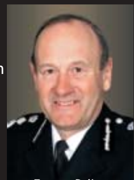
Former Police Commissioner Sir John Stevens

Britain's official investigation into the death of Princess Diana has been anything but easy, according to Lord Stevens of Kirkwhelpington, the former Metropolitan Police Commissioner. He is heading 'Operation Paget' - the name given to the overall inquiry intended to answer many of the puzzling circumstances of the fatal crash in the Pont d'Alma underpass in Paris in 1997. Lord Stevens has revealed that it "has been much more complicated than any of those involved had anticipated." The couples Mercedes was being pursued by photographers after leaving the Ritz Hotel for Mr Fayed's apartment.